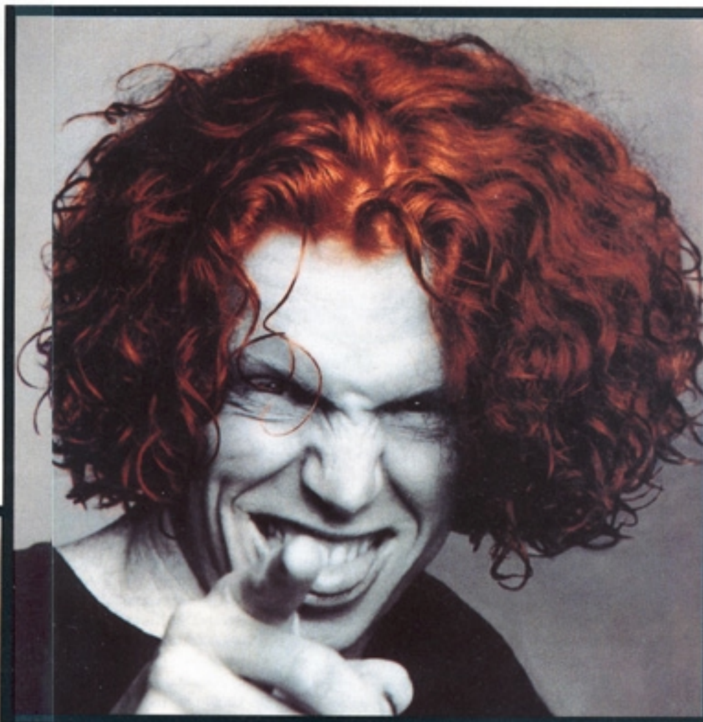
No joking: Comedian Carrot Top says Orlando is good for his hair as well as his lifestyle. Star maker Lou Perlman (left) and actress Rena Mero (far left) agree about the diversity of their chosen hometown.

"This city can bring out the kid in everyone!" she concludes.